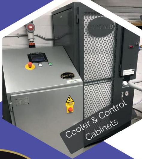
Cooler & Control Cabinets