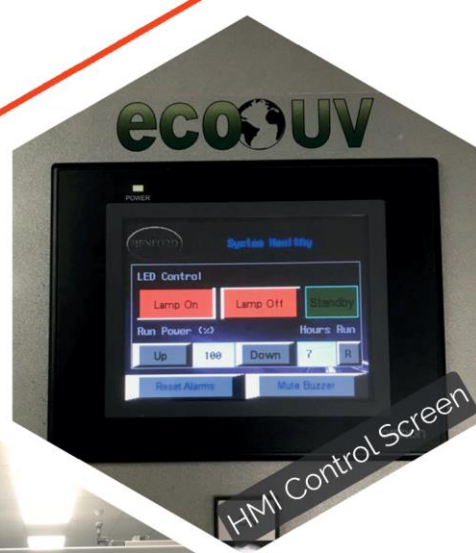
HMI Control Screen